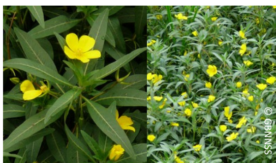
Creeping Water Primrose