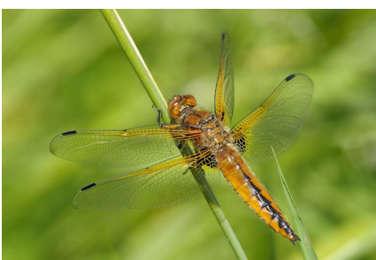
Scarce Chaser Dragonfly