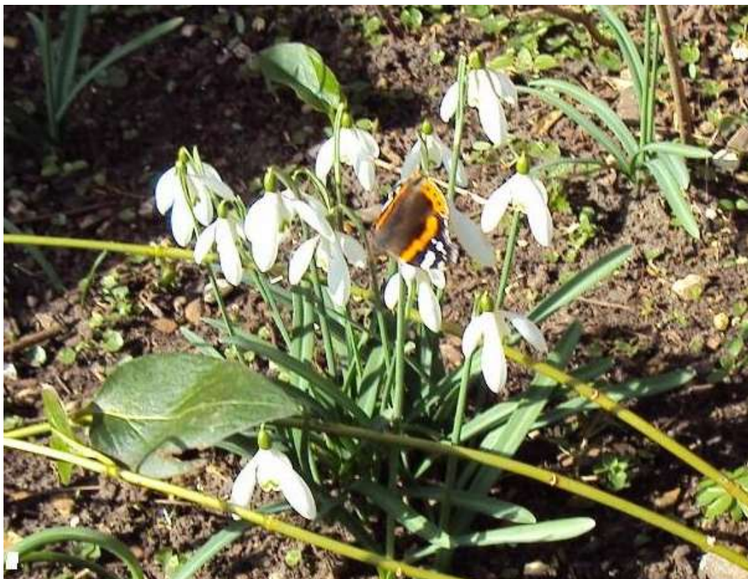
1 - Red Admiral on Snowdrops, March 2010 (Victor Bugg)