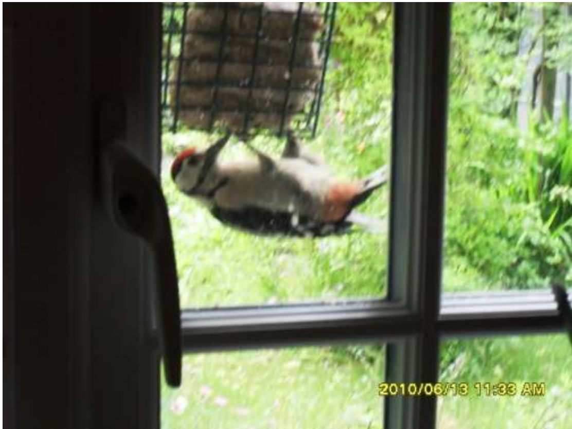
4: Great Spotted Woodpecker, 13 June (Susan Hodges)