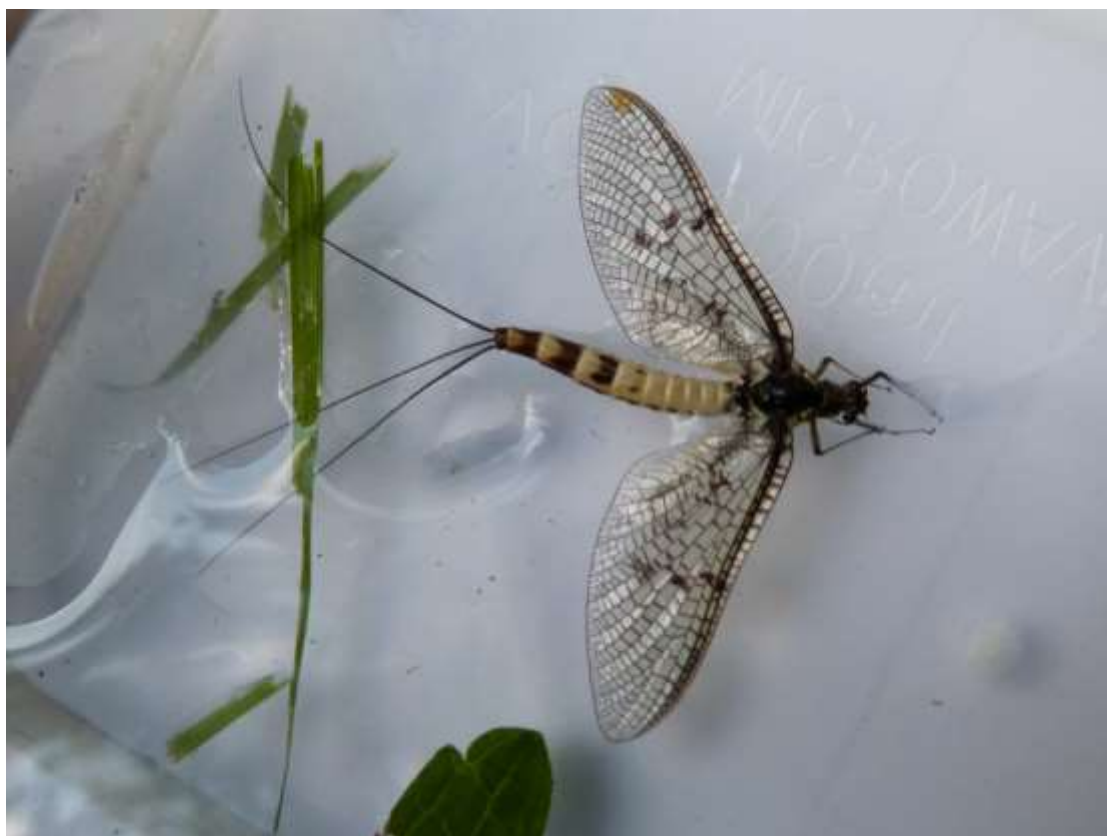
3: Mayfly, 8 June