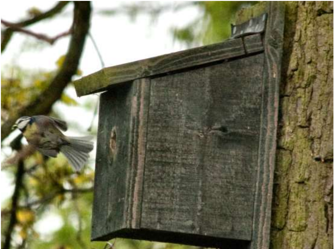
6: Blue Tit, May (James Cracknell)