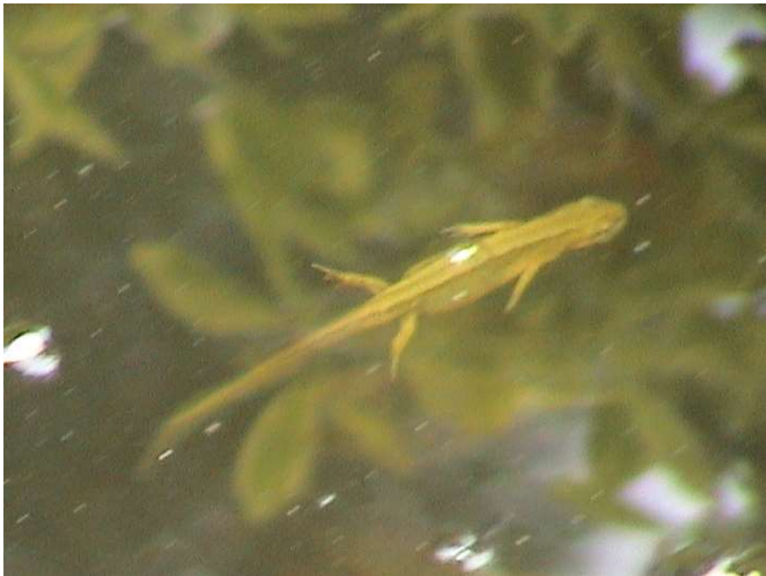
8: Newt in garden pond, 27 April