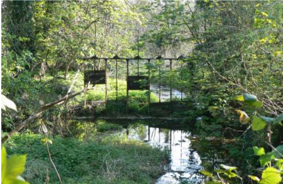
3: Bottomer Sluices - before restoration

The Environment Agency carried out some repairs and improvements around the old Bottomer sluices in Sluice Wood. The channel had become partially blocked by debris and silt and a flood had then damaged it. It is now restored and has been working well during a wet winter! Regrettably, they EA decided to remove the old gates in the interests of safety.