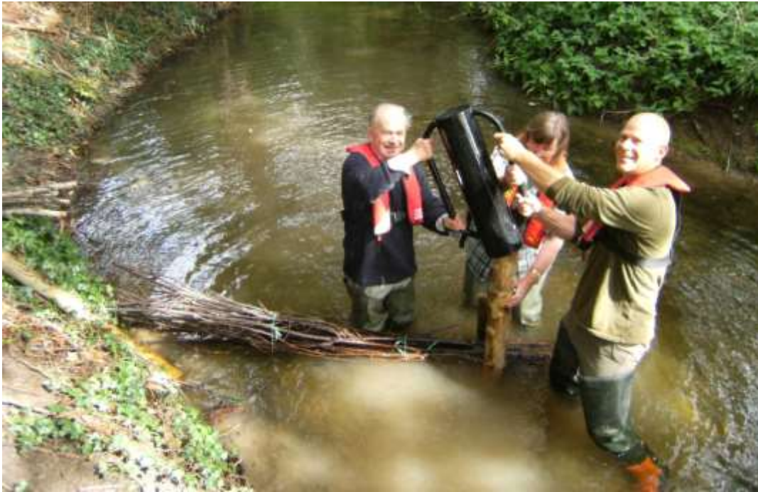
4: Driving the wooden pile supports