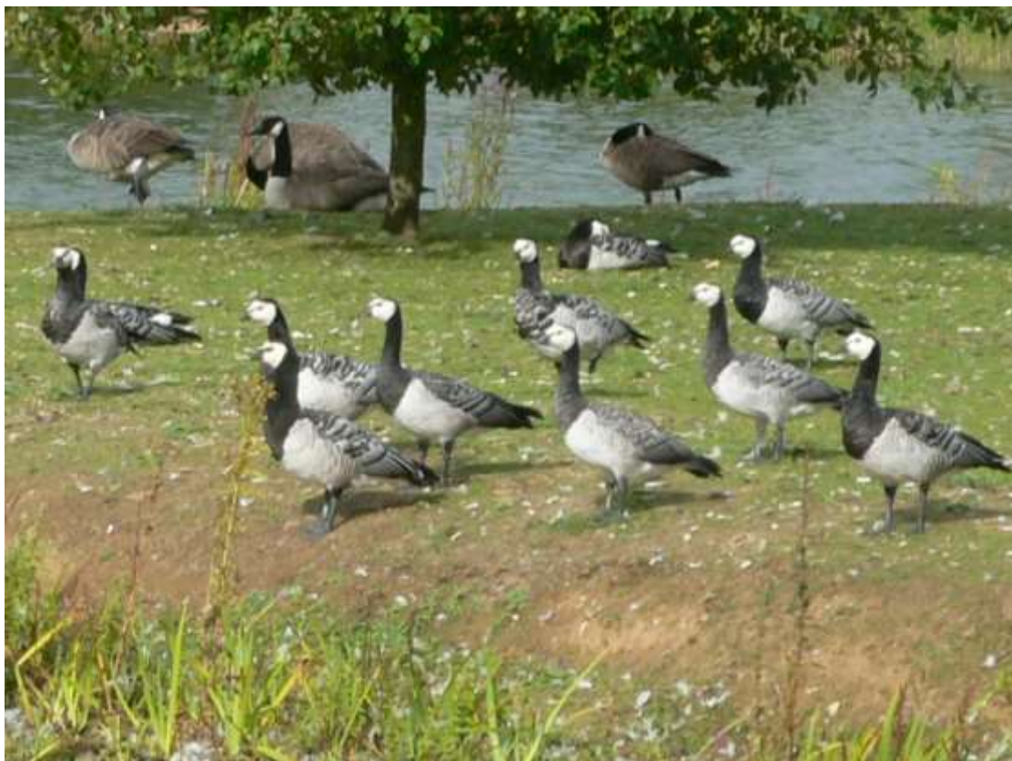
5: Barnacle Geese at Granta Park, 20 August (George Woodley)