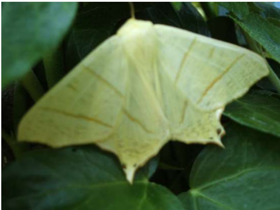
10: Swallow-tailed Moth Ourapteryx sambucaria , 28 June (Sally Turnidge)