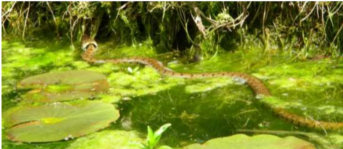
Grass snake, South Road (May 2009)

Grass Snakes were observed in Little and Great Abington but were not reported in any number. The first reports this year were in April, in Little Abington (Cambridge Road and 10 Bourn Bridge Road). From April till September some large snakes were seen, in May for example a snake at least three feet long was recorded in an open pond. In June another grass snake was reported in a pond in the Buggs' garden in Great Abington, and another at 32 West Field, Little Abington, in August. The last report came on 3 September, when Derek Turnidge found in his compost a very small snake, which had probably been born earlier in the year.