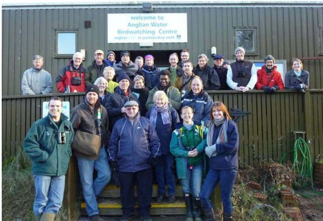
1: RiverCare network meeting, January 2011

We were invited to the first Network Meeting on 20 January 2011. Representatives from twenty groups around East Anglia converged on the Anglian Water Birdwatching Centre at Rutland Water to share ideas and experiences.