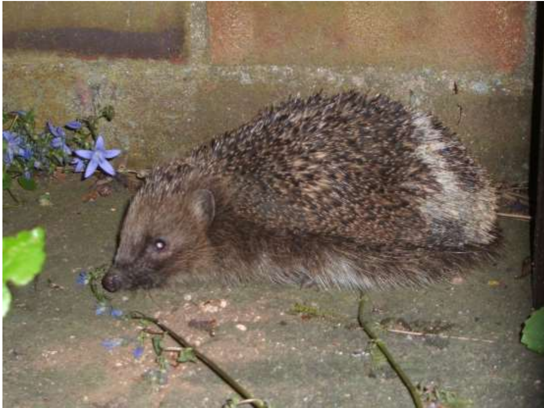
7 - Hedgehog, 17 June (Sally Turnidge)