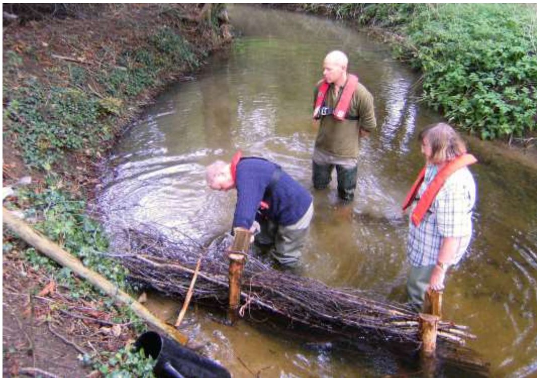
5: Fixing the faggots