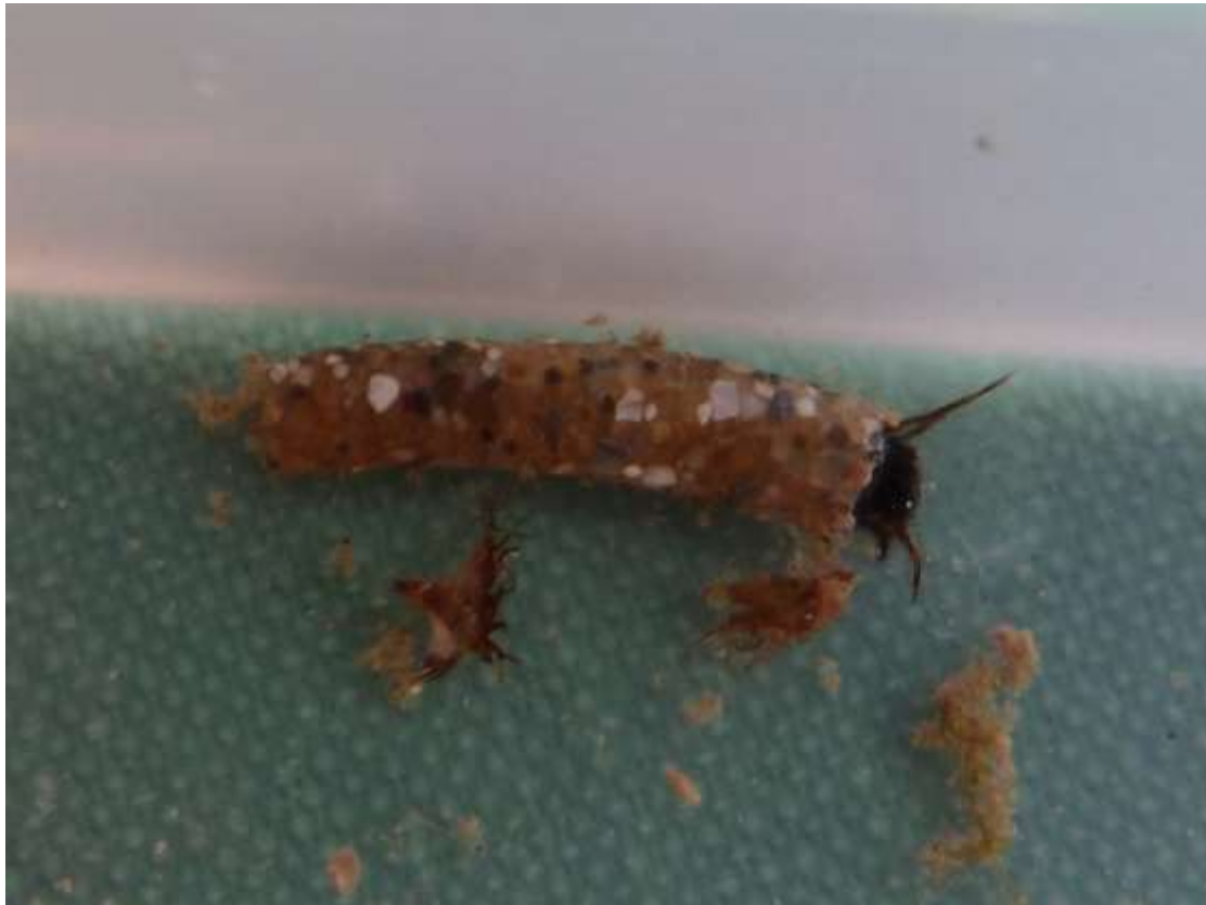
2: Caddisfly larva, 13 May (Peter Brunning)