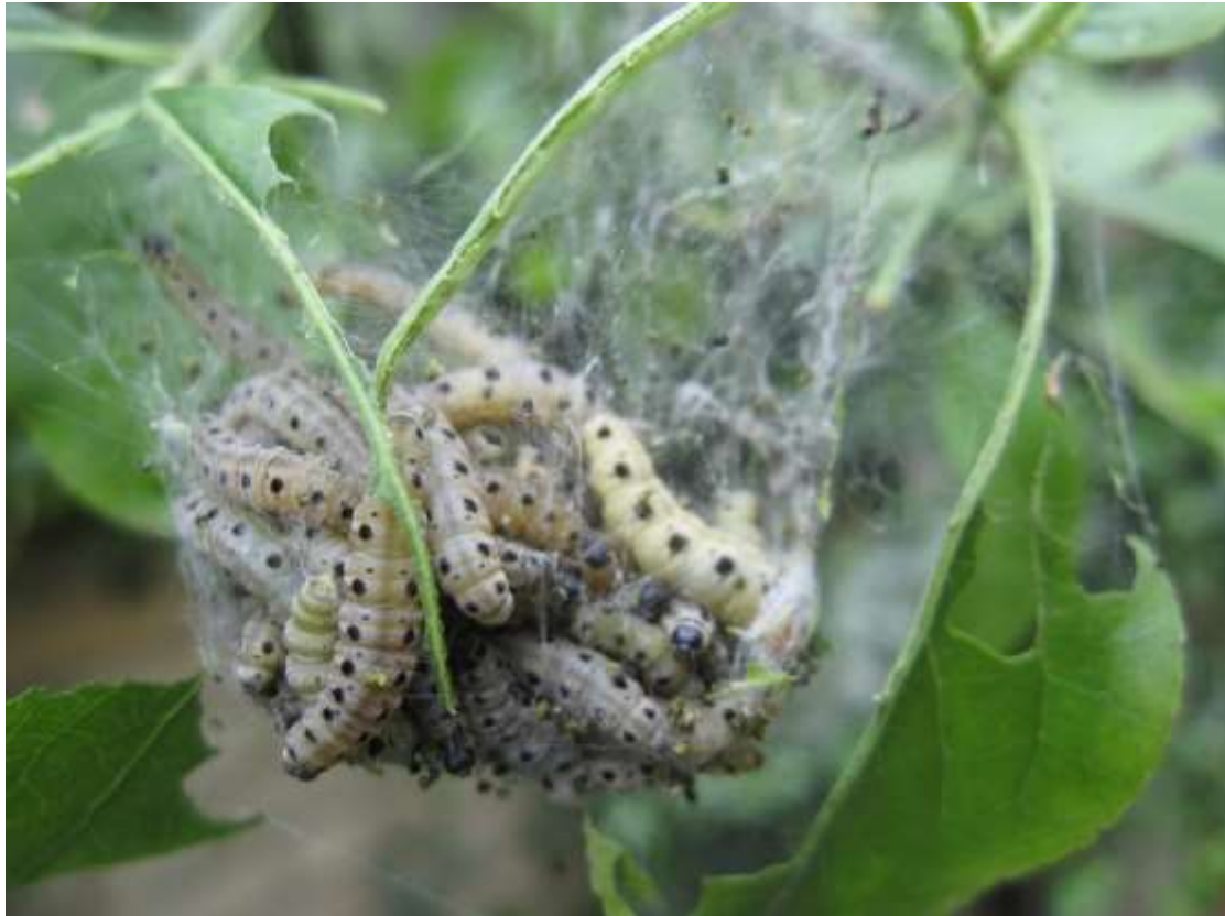
9: Spindle Ermine moth caterpillars, 12 July (Jennifer Hirsh)