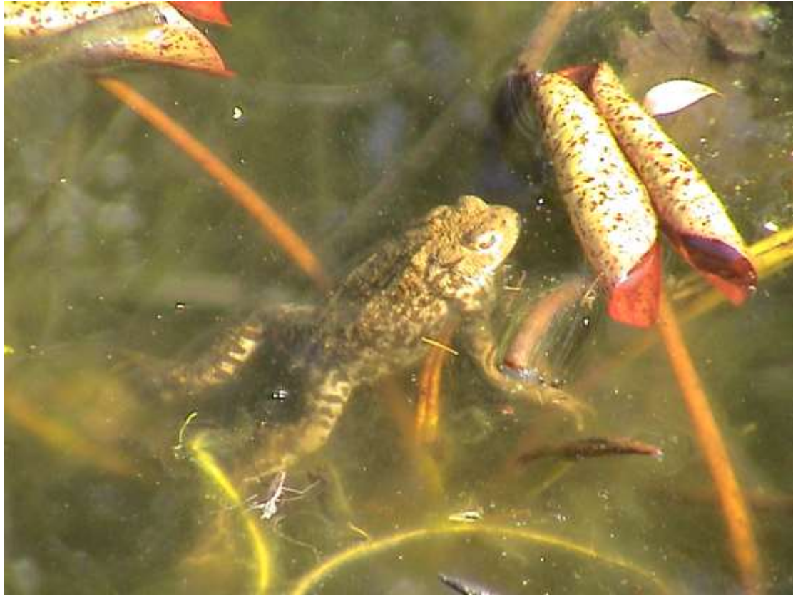
7: Toad in garden pond, 23 April (Derek Turnidge)