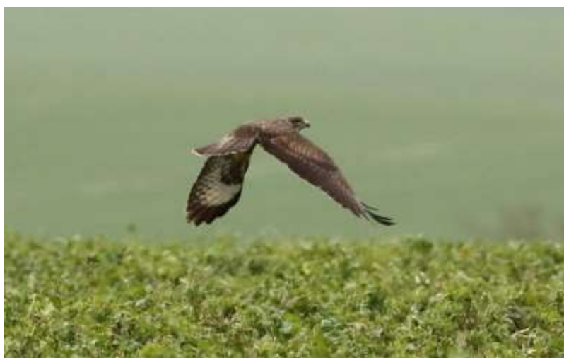
Buzzard flying over Old Railway Cutting