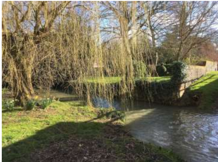
Abington's river on 6 March. It is kept in good order by the Rivercare Group.